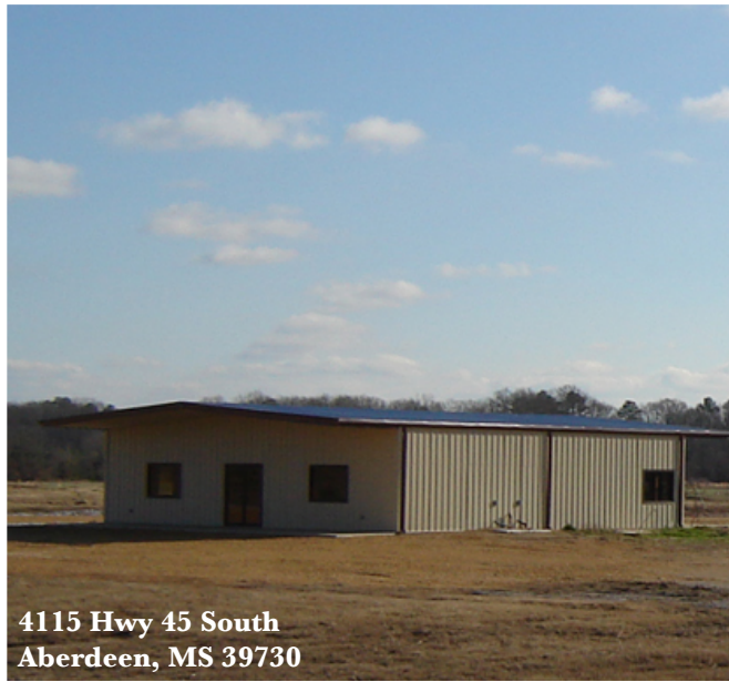
4115 Hwy 45 South Aberdeen, MS 39730